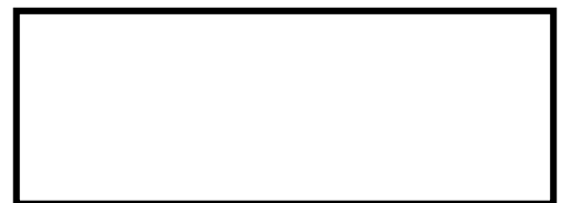
table north slowly money map farm pulled draw voice seen